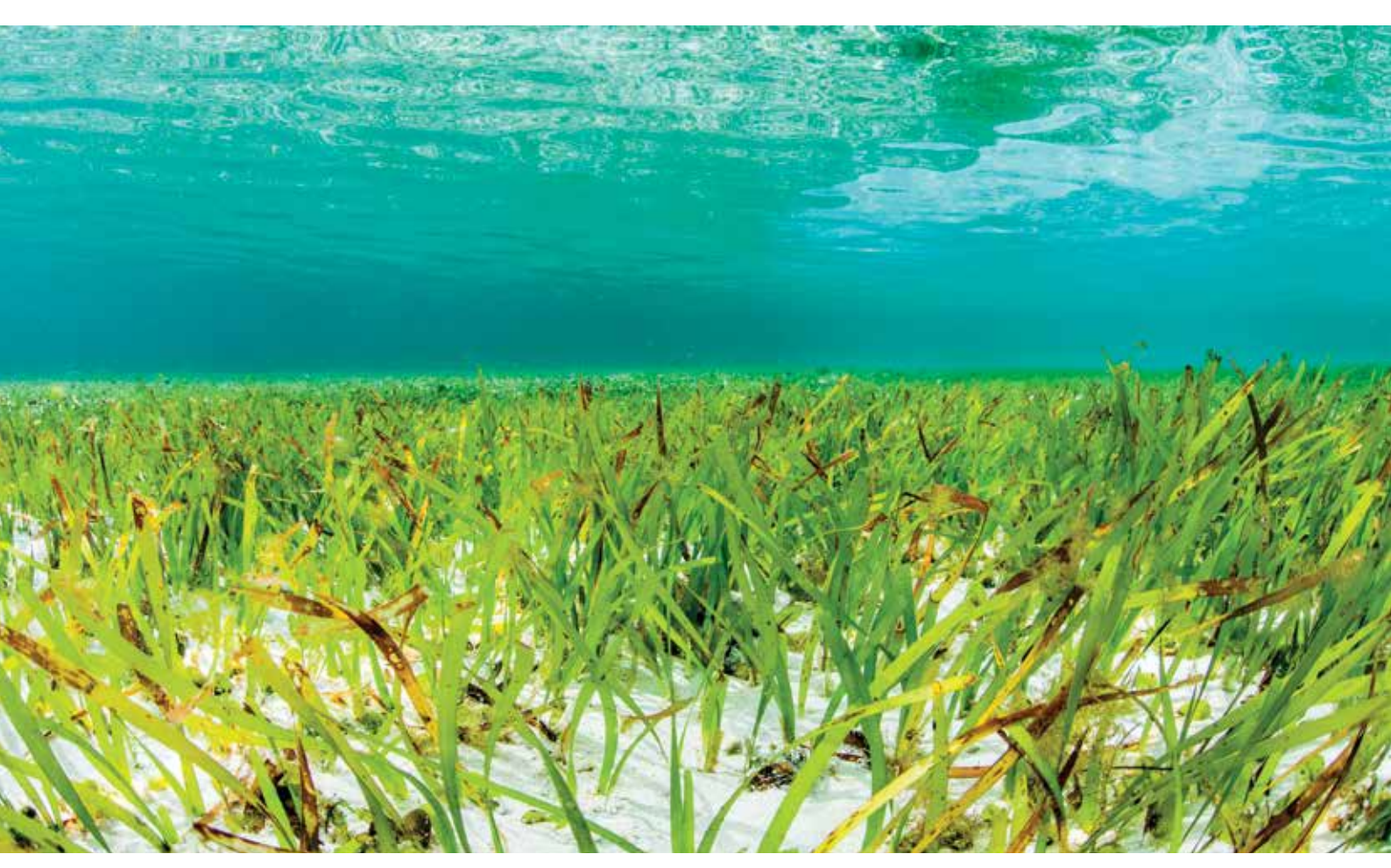
Vivid seagrass.; COVER: Mangrove roots.; BACK COVER: Hazy lake with birds in water.