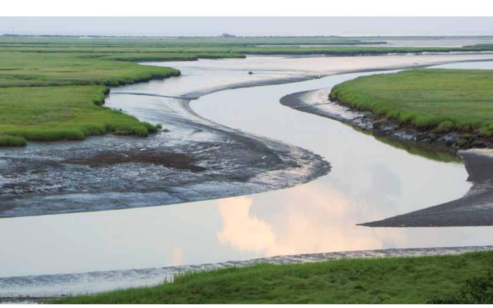
Aerial marsh.

These guidelines are designed to speak to all 151 countries that contain coastal wetlands, irrespective of their level of economic development and regardless of the type and nature of the country's NDC commitments. There is no 'one-size-fits-all' NDC. An NDC for an industrialized country — such as Australia — will be different to an NDC for a small island developing state (SIDS) such as Fiji. NDCs are, by definition, determined by the individual countries with the common goals described in the Paris Agreement and as tools of incremental change. Thus, NDCs do not need to reflect a perfected blue carbon accounting framework or set of targets. Rather, they offer the opportunity for each country to move towards comprehensive blue carbon coverage and targets over time, as relevant to country-specific contexts.